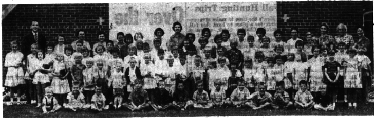
87 Smiling Faces...

12700 Cleveland, Detroit 4, Mich. WE 4-2300. Priced Right and Fully Guaranteed.