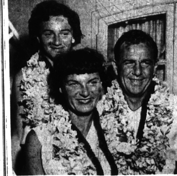
Touring the Islands

The mother of the bride wore a gown of beige crepe with lace trimming. The groom's mother