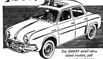
The SMART small car—latest models, just arrived from France

IMMEDIATE DELIVERY PRICES BEGIN AT $1370 P.O.E.