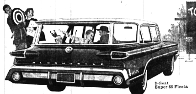
2-Seat Super 88 Fiesta

WM. VASU Funeral Home 4375 N. Woodward Ave., between 13 & 14 Mile Roads Liberty 5-5206