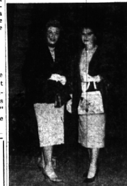
21 Days in Hawaii