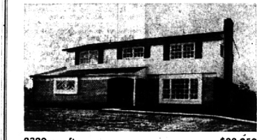
2320 sq. ft. $33,950