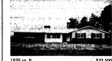
1830 sq. ft. $32,500