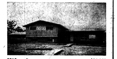
2910 sq. ft. $35,950