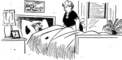
"If this is Monday morning, go get my rifle out of the hall closet, place the muzzle against my temple--"