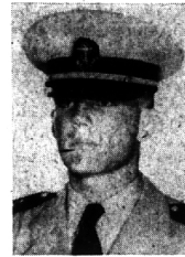
A Platoon Leader