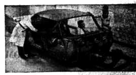
UNIBODY Construction: frame flows into the body, makes it twice as strong, twice as quiet—surrounds you with silent strength.

Pure automobile—built to be what you want a car to be. You'll know that the moment you see one. You'll know it even more the minute you take the wheel. They're coming soon. Watch for them.