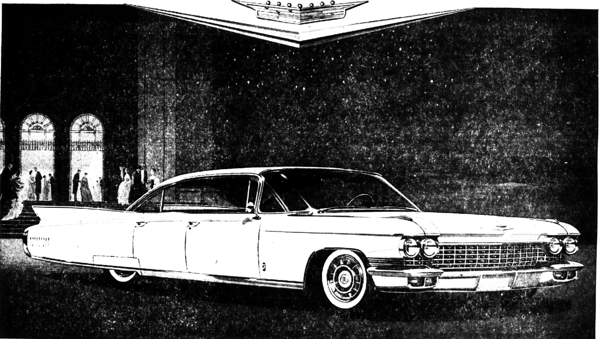
THE FLEETWOOD SIXTY SPECIAL