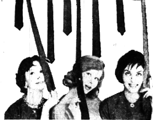
as seen on JACK PAAR NBC-TV Show