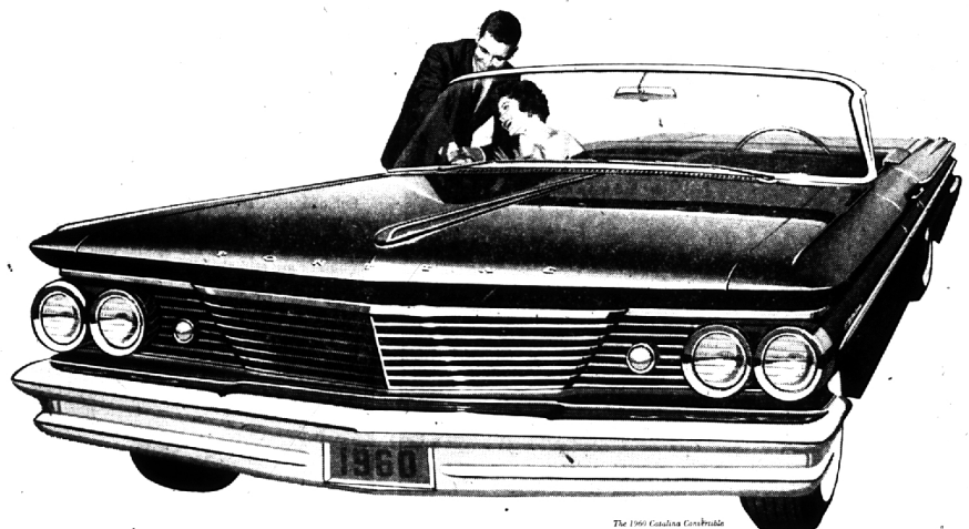
The 1960 Catalina Convertible

You find it attractive because of the simplicity of lines, the absence of over-design.