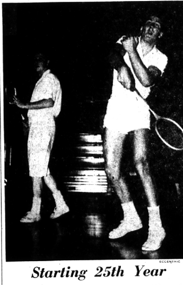
Starting 25th Year