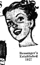
Bessenger's Established 1927

BAMBOO DRAPES and Woven Wood Shades all custom-made beautiful colors