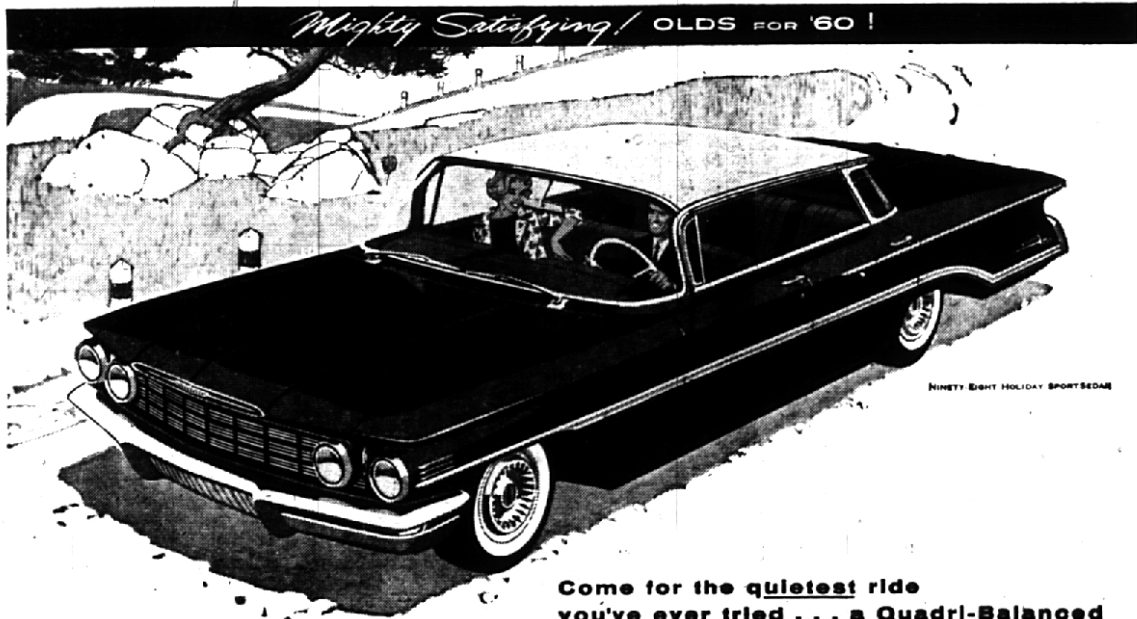
NINETY EIGHT HOLIDAY SPORT SEDAN