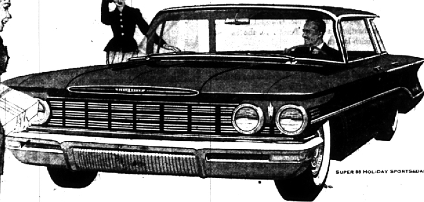
SUPER 88 HOLIDAY SPORTSMAN

Olds brings you the quietest ride you've ever tried... with new Vibra-Tuned Body Mountings to insulate the body from road noise and harshness... new nylon-sleeved shock absorbers, with more constant viscosity fluid, for new smoothness... Come in and drive one of the 17 new Oldsmobiles... see why Olds for '60 will be the most satisfying car you've ever owned!