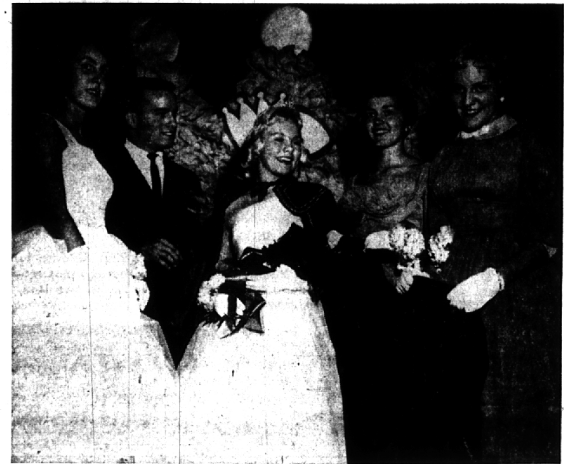
'Surely' a Queen