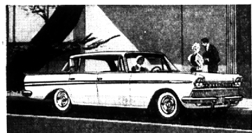
1960 Ambassador V-8 by Rambler—the compact luxury car with new improved fuel economy.