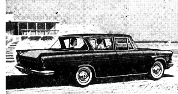
1960 Rambler Custom 4-Door Sedan—Higher, wider doors offer easier entry and exit.

Now see Rambler for '60. Proved by 10 years of building Compact Cars. 25 billion owner-driven miles. Two full decades of pioneering in modern airplane-type Single Unit Construction.*