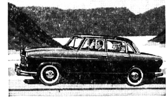
By popular demand—All new Rambler American four-door sedan for 1960.