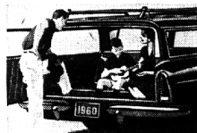
3 WIDE SEATS, 5 BIG DOORS. Room for biggest families. Swing-out tailgate has positive key lock so children can't open it. No climbing over seats or tailgate to get in third seat.

See styling that's fresh, exciting, tasteful. See entirely new models. High, wide doors let you step in, not stoop in. See the new standard of basic excellence at your Rambler dealer October 14.