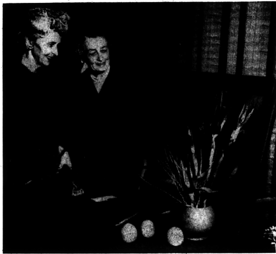
Members of the Needlework Guild are gathered around a table during their meeting.