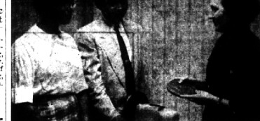
Hold Pow Wow of Their Own