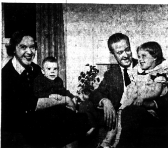
The Henry family of Traverse City

"There are times when it is almost impossible to express one's appreciation..."