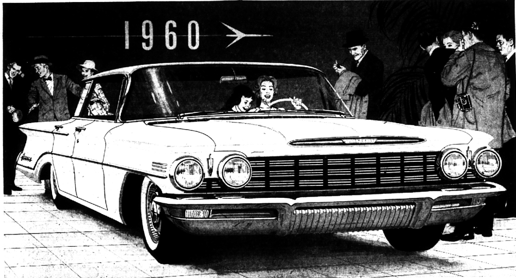
THERE'S NOTHING LIKE A NEW CAR... MAKE YOURS A ROCKET ENGINE OLDS!