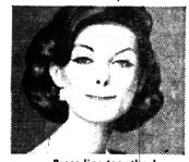
Press lips together!

First Roll-On Lip Color—'Lip Quick' Takes place of lipstick, lip liner and lip brush!