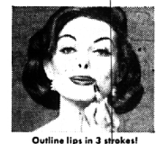
Outline lips in 3 strokes!