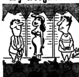
"Arrest that woman for petit larceny...she stole my husband!"