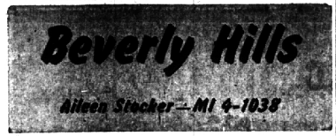
Aileen Stecker—MI 4-1038