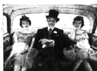
CAN DO CARS GIVE YOU EXTRA ROOM IN BACK, TOO

But one of the most important differences in cars this year is in back. Maybe you do most of your riding up front. But the rest of the family, and guests, probably ride in back. They'll find the back seats are extra comfortable in Forward Look Cars for '59. New body designs add inches of a-t-e-t-h space for legs, knees, hips and hat.