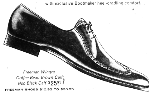
Freeman Wingra Coffee Bean Brown Calf, also Black Calf $25.95

FREEMAN introduces the most distinguished footwear of the year... glowing in dark Coffee Bean Brown. Trim and light, with exclusive Bootmaker heel-crading comfort.