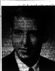
At Hubert Agency

if you are able to furnish helpful clues as descriptions of persons involved, license numbers on cars or other hints which will help in finding the swindlers.