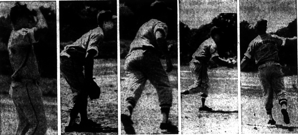
Ruddy Adjusts Cap . . . Gets Ready . . . Starts After Ball . . . Makes the Grab . . . Throws the Man Out