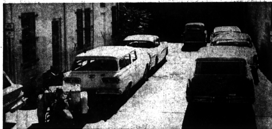
SOME PEOPLE SEEM not to pay attention to sign posts. From a second floor across the alley, The Eccentric's camera spots eight infractions of the parking rules. That's undoubtedly what the motorbike officer is away checking on.