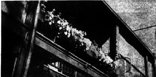
SOME PEOPLE WANT MORE to their alley than utility. Here a second-floor tenant has added some beauty by setting flower boxes along the porch railing.