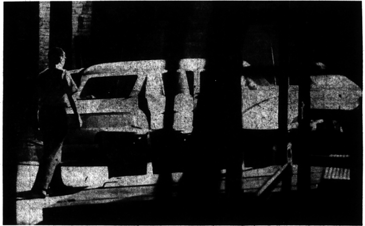
FROM DEEP IN THE SHADOWS, our camera concludes its alley trip with an observation of the occasional alley pedestrian. Like this man who passes by a station wagon, whose owner has gone back for more of his or her purchases (note car's open rear door).