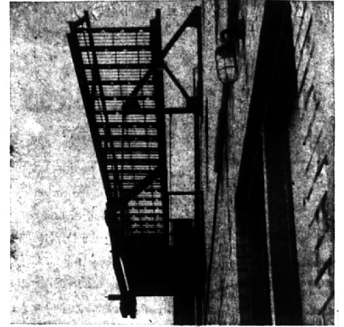
FIRE ESCAPES on the two-story buildings overhang the activity of the alley. Rarely used, they are a vital part of the alley scene.