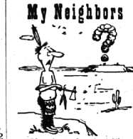
"Now isn't that just like a wife? Questioning, always questioning!"