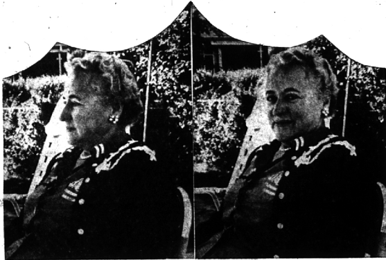
They saw the queen.