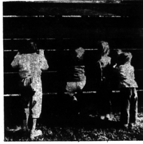
peeked thru a fence.