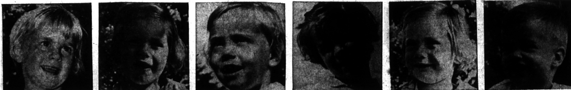
... and invited the children to join in the fun. Oh, how the little ones smiled. Even the giant grinned!