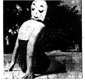
... both ways!