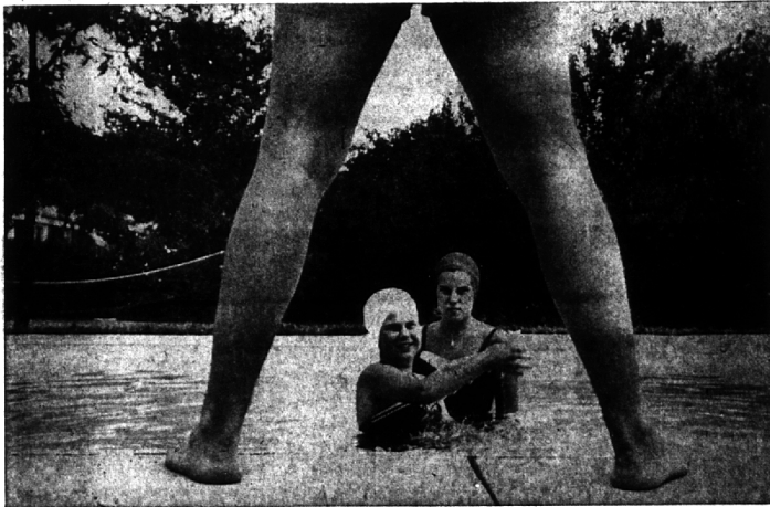
And they saw the giant who guards the girls, too.