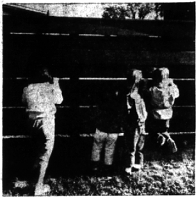
... some little children