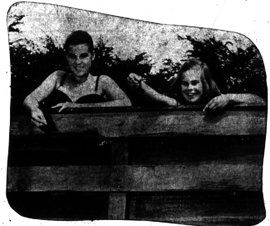
But then the princesses saw them...