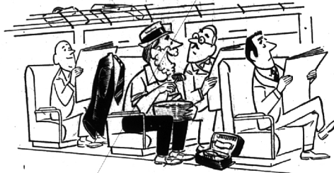
"Haven't missed the of 8:12 in nine years!"