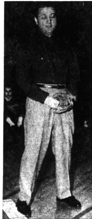
The photographer's flash made Boston hurler Ike Delock blink, but it didn't stop him from showing how to pick off a man at first base during the baseball clinic held at Derby school Saturday. Delock also showed the fans the finer points of pitching.