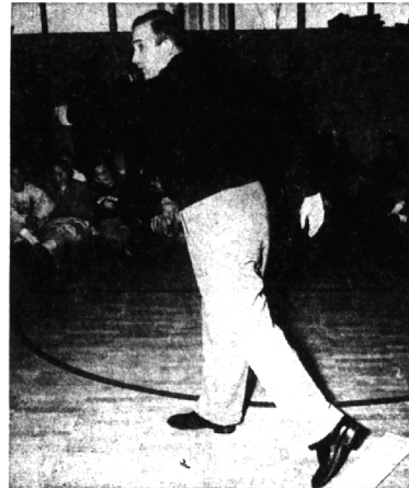
While Ike Delock demonstrated the art of pitching from the right side of the mound, Chicago's ace portside Billy Pierce showed fans how it is done from the left side. Here Pierce stresses the importance of balance and footwork in delivering the ball to his group of interested listeners. When he finished his lecture on pitching, Pierce showed the youngsters how to hunt properly for that sacrifice play. Since he is one of the best bunters in the league, the boys (and girls) listened carefully.