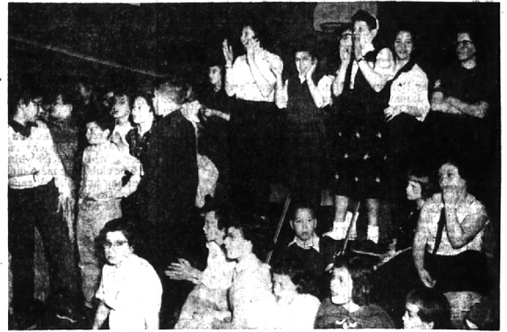
Student spectators cheer their classmates while others watch the game intently. At least 125 youngsters attended the Jan. 28 matches. According to school officials, this was the first volleyball tilt between students and teachers. A basketball meet and softball game are on the agenda in the early spring.

6-C THE BIRMINGHAM (MICH.) ECCENTRIC Feb. 5, 1959