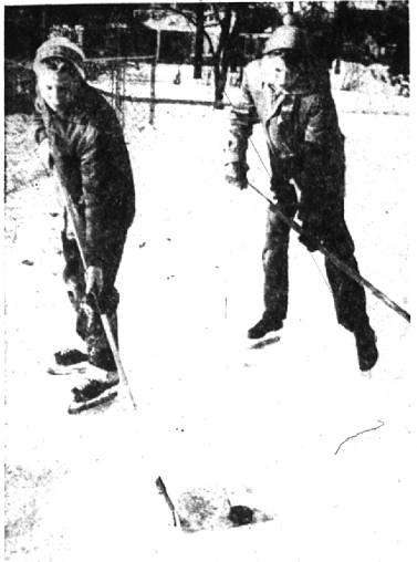
Their Own Rink