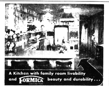
A Kitchen with family room livability and FORMICA beauty and durability . . .

OLSEN'S MARKET WEST BROWN AT CHESTER • WE DELIVER MI 4-1916 Closed Sunday — Ample Parking