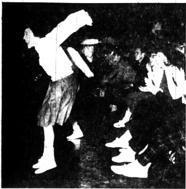
This Southfield high school cheerleader had lots of things to cheer about during the first half, but she was a sad little lady during the second half as the Blue Jays bowed to Pontiac Northern, 62-14. On this shot, the Jays had just tied it up before halftime.