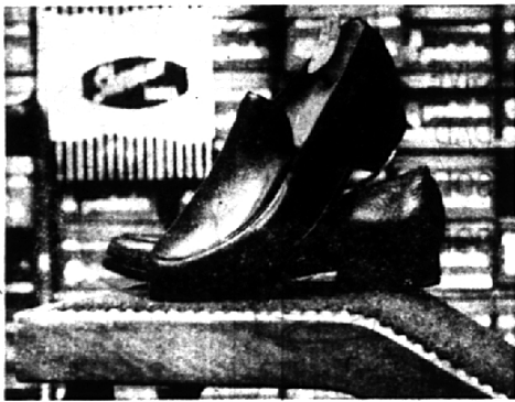
A pair of Florsheim shoes comes into focus against a background of boxes representative of the large collection of fine shoes available at Sherman Shoes.

It was at that time that other departments were dropped and all (See ELEGANCE-Page 6)