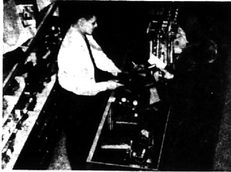
Early Christmas Shopper

Quality is the keynote of all merchandise to be found at 268 (See CLOTHIER-Page 6)