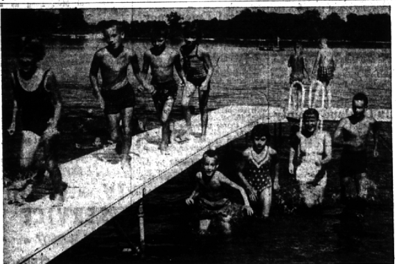
Wing Lake Swim Meet Winners

Both the Finks enjoy golf and Fink's hobby is building model planes and boats.