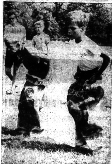
The Birmingham YMCA day camp at Rochester has games for everyone, including sack races as pictured above. Steve