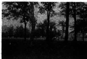
BACK YARD—3rd FAIRWAY