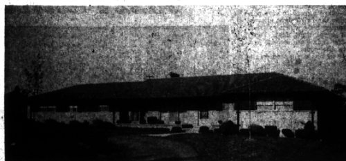
190 FT. LOT IN BERKSHIRE VALLEY

This lovely Roman Brick Ranch has a lifetime tile roof. In the Berkshires, this home has extremely lovely landscaping and unusually superior interior appointments. 3 "exceptional" bedrooms each with an adjoining bath. All new built-in appliances. Circular drive and a 2 1/2 car att. garage. Many "extra" features in this home that you should see. $36,500.00.