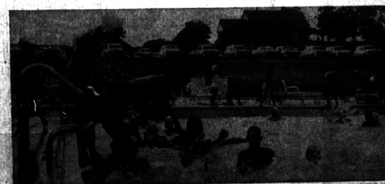
The temperature was over 90 degrees but the Birmingham youngsters didn't notice it at the Birmingham Athletic Club last week.