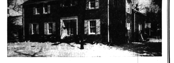
A brick colonial of "timeless" design, yet with a pleasing departure from traditional in the NEW family room with a beamed ceiling and paneled in cherry wood.

The owner is en route to Bermuda. $45,900.