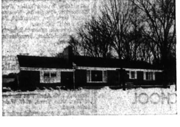
Near Oakland Hills Country Club, tall trees form this spotless brick ranch home. A beautiful lot, thoughtfully landscaped.

A fine kitchen has eating space. 22' screened porch, two car attached garage, three bedrooms, full basement. Carpeting with foam rubber pad completes the living room, dining room, and hall. Drapes are also included.