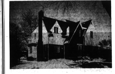
Pleasant Street, by the Chesterfield shops and Birmingham churches ... an appealing home with s-p-a-c-e!

Near Quarton School, value that is unequalled. $39,500.