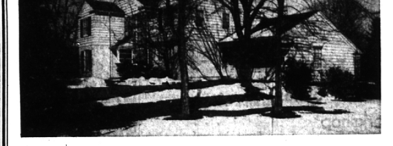
On a hill, in the manner of a country estate, yet located in the City just three blocks from Quarton School. 120' frontage of beautifully landscaped grounds with mature trees.

This four bedroom, three bath Farmhouse Colonial offers a way of life with conveniences that are hard to match. Delightful library overlooking the ridge. Two fireplaces: one in the recreation which also has a built-in bar.