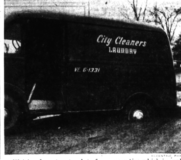
Waiting for a tow truck to free a rear tire which is sunk in the mud, a truck driver in Beverly Hills feels the results of the big spring thaw.

THE PRESENT state of roads was reached under a set-up in which the one-year-old village of Beverly Hills uses for roads none of the five-mill tax residents pay to the village. Only monies the village uses for roads are returns from the state gas and weight tax collections. Under the law, the gas and