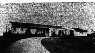
Delightful neighborhood near the Convent and commuter.