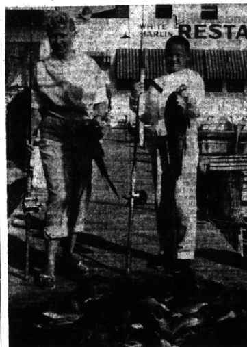
"How's This Look, Dad?"

Selling your house? Advertise it in the "For Sale—Houses" column of The Eccentric.