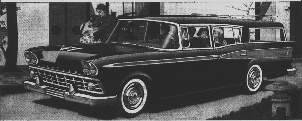
NEW! 1959 RAMBLER CUSTOM CROSS COUNTRY. Features new beauty, new economy. 108-inch wheelbase. Economy Six or Rebel V-8.