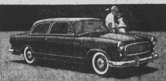
NEW! 1959 RAMBLER AMERICAN CLUB SEDAN. 100 1/2 inch wheelbase. Offers automatic transmission, reclining seats.