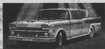
NEW! 1959 RAMBLER CUSTOM FOUR-DOOR SEDAN. 108-inch wheelbase. 215 HP Rebel V-8, or Six.