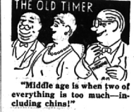
"Middle age is when two of everything is too much—including chins!"