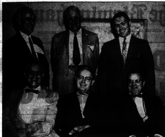
Y's Men's Club Introductory Meeting

Looking for a pet for the children? See the Classified column under "Pets for Sale."