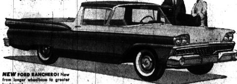
NEW FORD RANCHERO! New front longer wheelbase to greater load capacity!