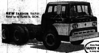
NEW TANDUM TILT! Rated by W. 7500 lb. GVW.